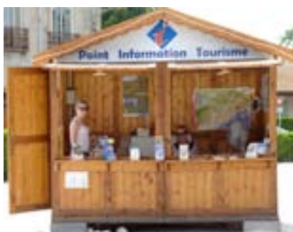
New Tourist Information Point Open through July & August in the little garden on the corner of ave. la marine

The agent used the picture to indicate a site in our commune, not in the village. An odd thing to do, granted, especially when the actual building site is well out of the village on the road to Florensac.