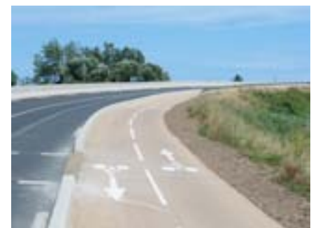
Even cycle tracks have their full range of control signs.

Road 'improvements' usually accompany these developments. There seems a policy of restriction so that traffic is forced to comply rather than allowing drivers to exercise prudence as they have until now. But does this forced compliance breed frustration?