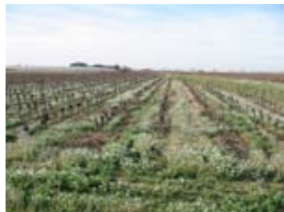
1990: Vineyards all the way.

The Languedoc is undergoing staggering changes. Only 10 years ago one left Montpellier airport and one was in vineyards.