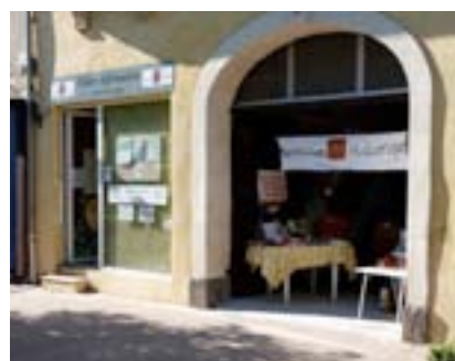
Oddments Sale Loads of bargains of items donated to M.H. Unfortunately not too successful, French ladies drive very hard bargains!